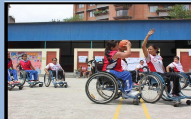
FEMALE WHEELCHAIR BASKETBALL MATCH MOBILE THROWING COMPETITION