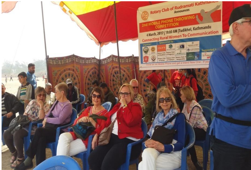
The guests from Rotary Club of Denver, USA attending the program