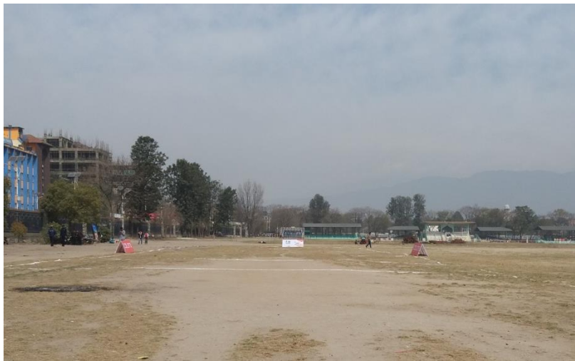
The ground being set up for mobile throwing.