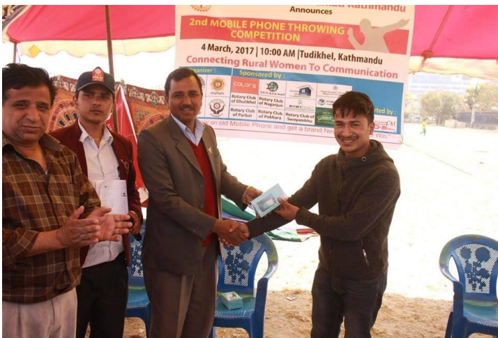
The winner from Male category, being provided with colors smart phone by President of Rotary Club of Rudramati