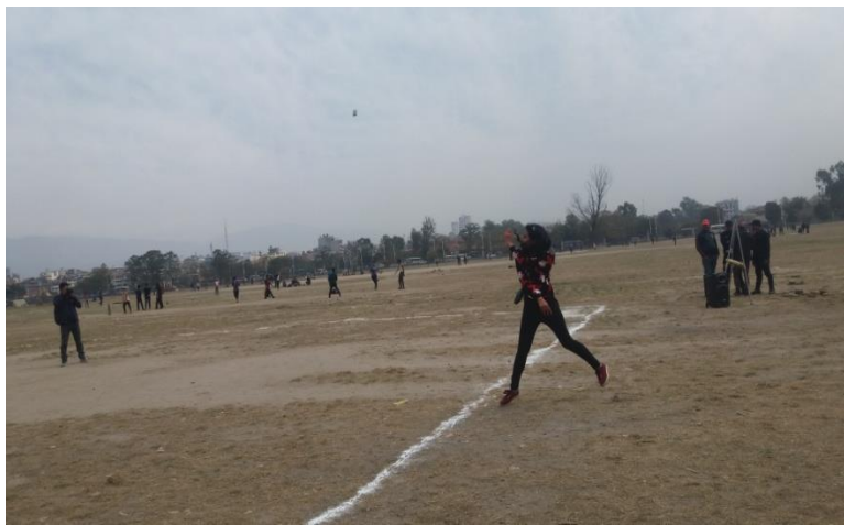
One of the participants throwing the mobile phone during competition