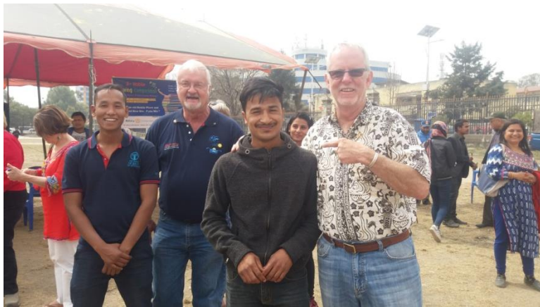
Members of Rotary Club from Denver with participants.