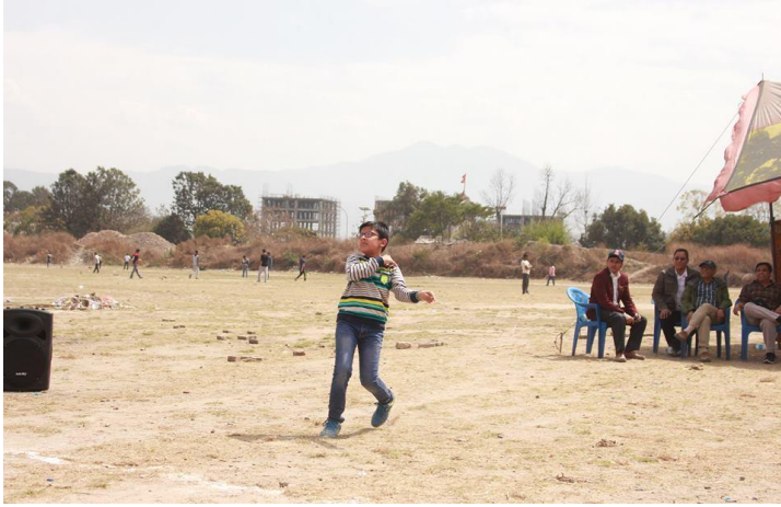
Participant below 14 years throwing the mobile phone